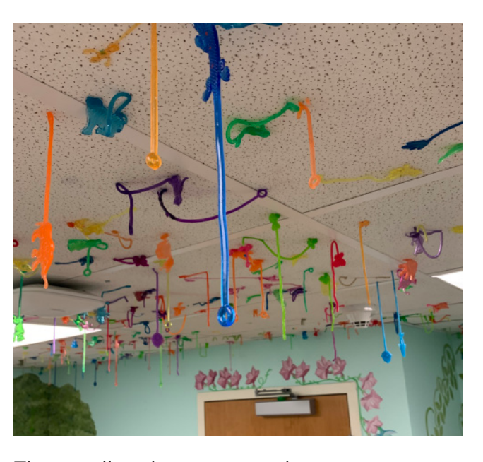
They realize they are not alone.

colorful sticky hands. Almost every child asks about them. Each hand was stuck to the ceiling by a different child who came into this room suffering from some form of abuse or neglect. When kids see all those hands, they realize that what is happening to them has happened to other kids too.