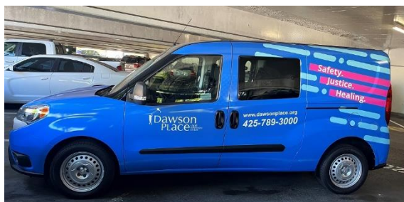
The Dawson Place Outreach Van!

Dawson Place purchased a new outreach van, thanks to a grant from the Employees Community Fund of Boeing Puget Sound . The van was completely wrapped and branded for free by FASTSIGNS in Everett. The new vehicle is used to transport the Outreach Team, materials, and equipment to events across Snohomish County. In Summer 2023, a parent called the front desk to request an appointment for their child and stated that they got our phone number from a Dawson Place van.