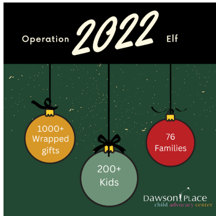
Operation Elf social media

holidays can cause deep anxiety for families who must decide between necessities and luxuries. For the last 7 years Dawson Place has carved out a few days in mid-December to invite families to come “shop” for gifts. The gifts are provided by individuals and businesses in our community who raise money and host toy drives specifically for this operation. Last year 22 volunteers signed up to help make the 2022 Operation Elf a holiday miracle for many happy kids and families. Over 1,000 gifts were selected by parents and guardians, wrapped on site by volunteers, and given to more than 200 kids from 76 families in our community.