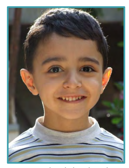
Dawson Place helps abused kids learn to smile again.